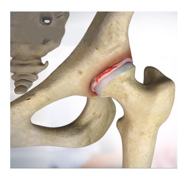
Here's What to Expect During Your Hip Labral Tear Recovery: A Timeline Overview

Gain insight into the hip labral repair treatment protocol with a holistic overview of the hip labral tear recovery process.